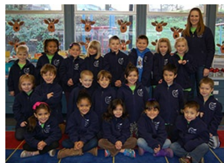
Last years winners:

This year, we will be having a friendly competition among classes! Have you turned in your 2015-16 Commitment Form for MPF donations? The first class to receive 100% of their families' commitment forms turned in, will receive a hoodie - the teacher will also receive a hoodie!