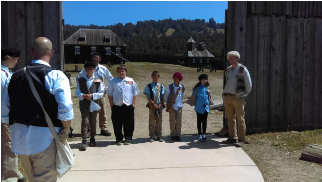
The Militia prepare to check the passes of those entering the fort