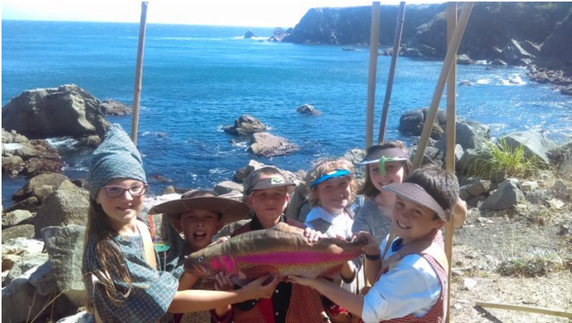
The Hunters display their "catch"